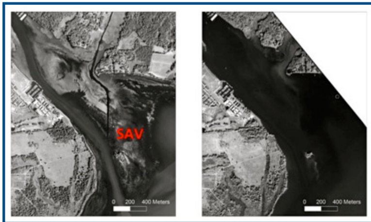
Underwater Grasses: Persistent high-water events due to intra-seasonal variability can block the sunlight underwater grasses need for growth, and also make it more difficult to obtain aerial photography for monitoring purposes.

“Our results are very preliminary at this point,” says Brubaker, “but there are a few things that stand out. One is that July and August are typically relatively quiet in terms of intra-seasonal high-water events. Another is that