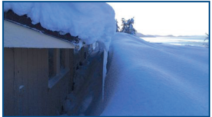
Snow House: So much snow fell during southeastern Alaska’s 2012 “Snowpocalypse” that the National Guard had to free people trapped in homes and businesses.

“We successfully submitted a Rapid Response proposal in spring 2012 and used the funds to look at the hydrology of the river during last year’s spring melt,” says Kuehl. “We first wanted to see what effects the melting