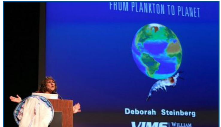
From Plankton to Planet: Professor Deborah Steinberg prepares to bring audience members on a voyage from Plankton to Planet during the Tack Faculty Lecture on October 29.

Donning “anglerfish hats” with glow-in-the-dark “lures,” the capacity crowd of nearly 400 people helped Steinberg recreate the look and feel of bioluminescence in the deep sea, one leg of their virtual voyage “From Plankton to Planet.” They also sampled jellyfish in Chesapeake Bay, dove the sapphire blue waters of the Sargasso Sea, collected lobster larvae from the Amazon plume, and weathered 50-foot waves on their way to Antarctica.