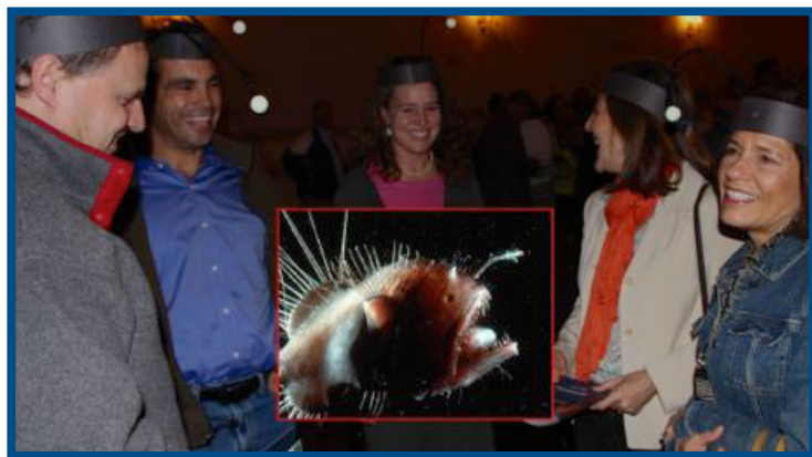
Anglerfish Hats: Audience members donned handmade anglerfish hats—a fun way to simulate the bioluminescence used by many deep-sea creatures for feeding and reproduction.