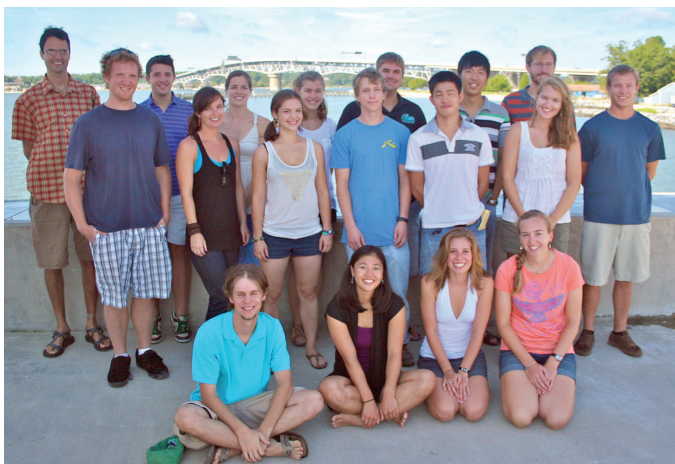
School of Marine Science incoming class of 2012.

A total of 120 students applied for admission in 2012, a