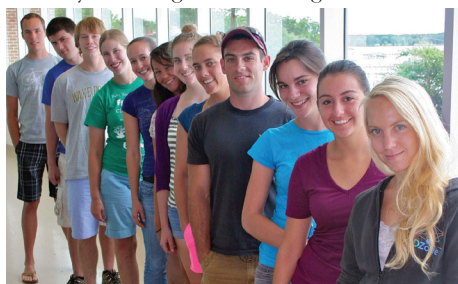
Summer Intern Class of 2012.

This summer's REU students came from as far as Florida, Iowa, Massachusetts, and Tennessee; and as near as the Carolinas and Virginia, with in-state participants from the College of William and Mary, Old Dominion, the University of Mary Washington, and Virginia Tech.